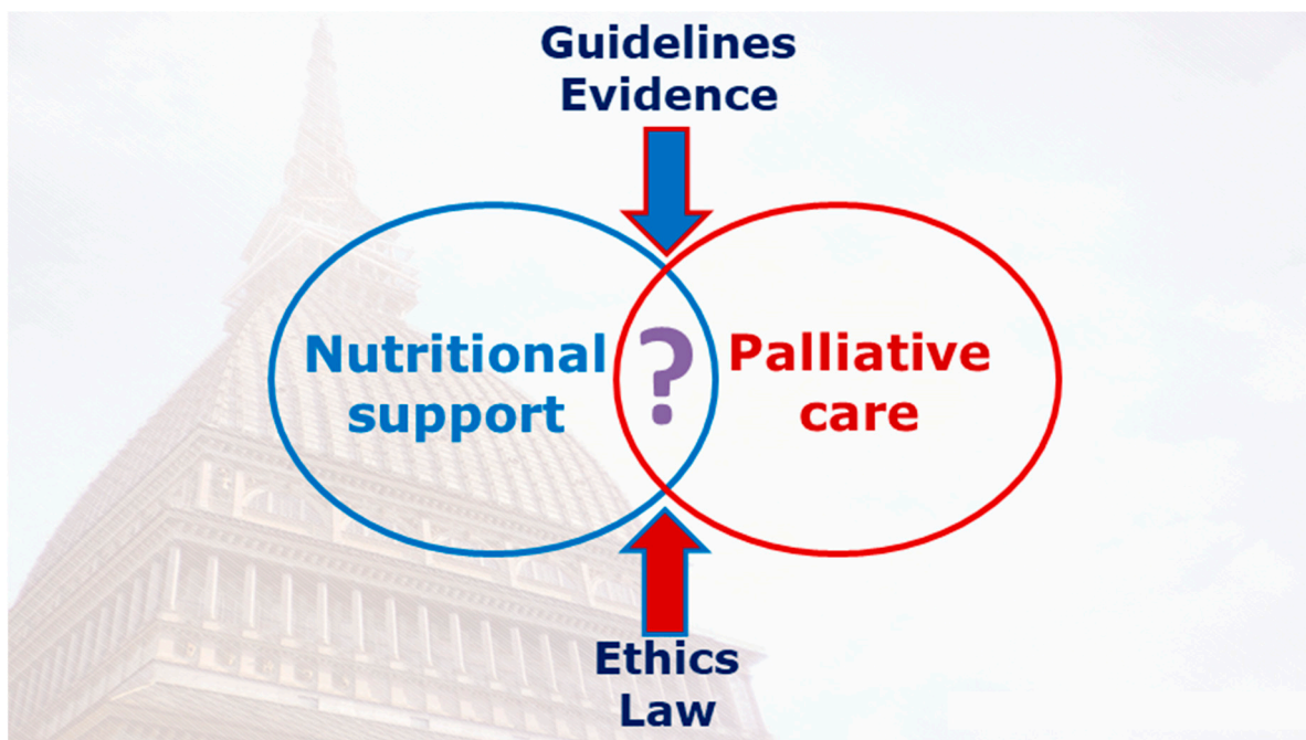
Figure 1. The area of overlapping between the two therapeutic approaches consisting of nutritional support and palliative care in light of the variables that determine their identification (guidelines, evidence, ethics, and law).

The purpose of this narrative review is intended to be a brief guide to prescribing nutritional support based on the European Society for Clinical Nutrition and Metabolism (ESPEN) guidelines [9] and analysis of the literature evidence in palliative cancer patients. Specifically, the aim is to identify in the cancer patient the area of overlapping between the two therapeutic approaches, consisting of nutritional support and palliative care, in light of the variables that determine their identification (guidelines, evidence, ethics, and law) (Figure 1).